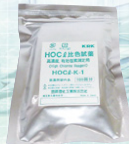
HOCℓ-K-1 Reagent for high density Chlorine Measurement